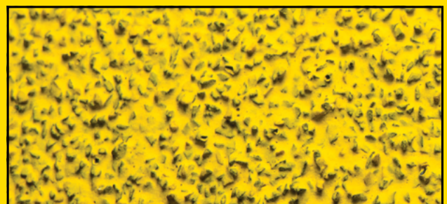
STRUCTURE SHOWS HYPER-SHARPENED CERAMIC HYBRID

PREDATOR™ ceramic hybrid material is a proprietary blend of self-lubricating abrasive grains, producing an aggressive cut. Integrated grinding aids further reduce grinding temperatures that extend the material life.