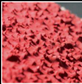
STRUCTURE SHOWS HYPER-SHARPENED CERAMIC TEETH