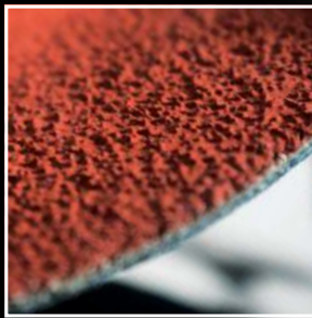
STRUCTURE SHOWS HYPER-SHARPENED CERAMIC TEETH